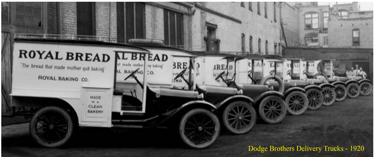
Dodge Brothers Delivery Trucks - 1920

year, Henry Ford decided to stop paying stock dividends to finance the construction of his new River Rouge complex, and the Dodges filed a suit to protect their annual stock earnings of approximately one million dollars, leading Ford to buy out his shareholders; the Dodges were paid some $25 million. They had already earned $9,871,500 in dividends making a total return of $34,871,500 on their original $10,000 investment. The contract with Ford set them up for life, but they never got to spend it. Both Dodge brothers died in 1920.