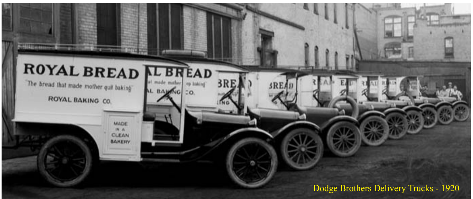
Dodge Brothers Delivery Trucks - 1920