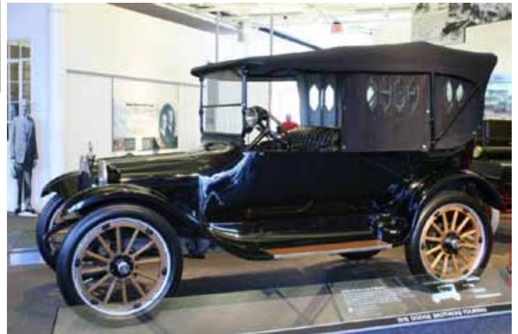
1915 Dodge Model 30/35

the norm until the 1950s); 35 horsepower engines versus the Model T's 20 horsepower, and sliding-gear transmission (the best-selling Model T would retain an antiquated planetary design until its demise in 1927). Once the Dodge brothers produced their own car, John Dodge was once quoted as saying, "Someday, people who own a Ford are going to want an automobile". As a result of this, and the brothers' well-earned reputation for the highest quality truck, transmission and motor parts they made for other successful vehicles, Dodge Brothers cars were ranked at second place for U.S. sales as early as 1916. That same year, Henry Ford decided to stop paying stock dividends to finance the construction of his new River Rouge complex, and the Dodges filed a suit to protect their annual stock earnings of approximately one million dollars, leading Ford to buy out his shareholders; the Dodges were paid some $25 million. They had already earned $9,871,500 in dividends making a total return of $34,871,500 on their original $10,000 investment. The contract with Ford set them up for life, but they never got to spend it. Both Dodge brothers died in 1920.